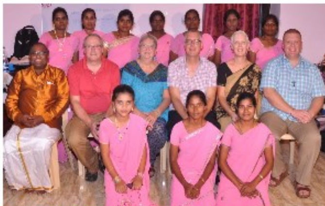
2018 Graduates with Mission Team